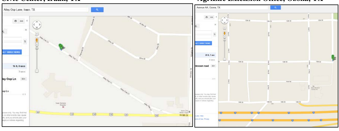
AgriLife Extension Office, Ozona, TX