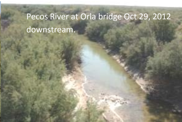
Pecos River at Orla bridge Oct 29, 2012 downstream.