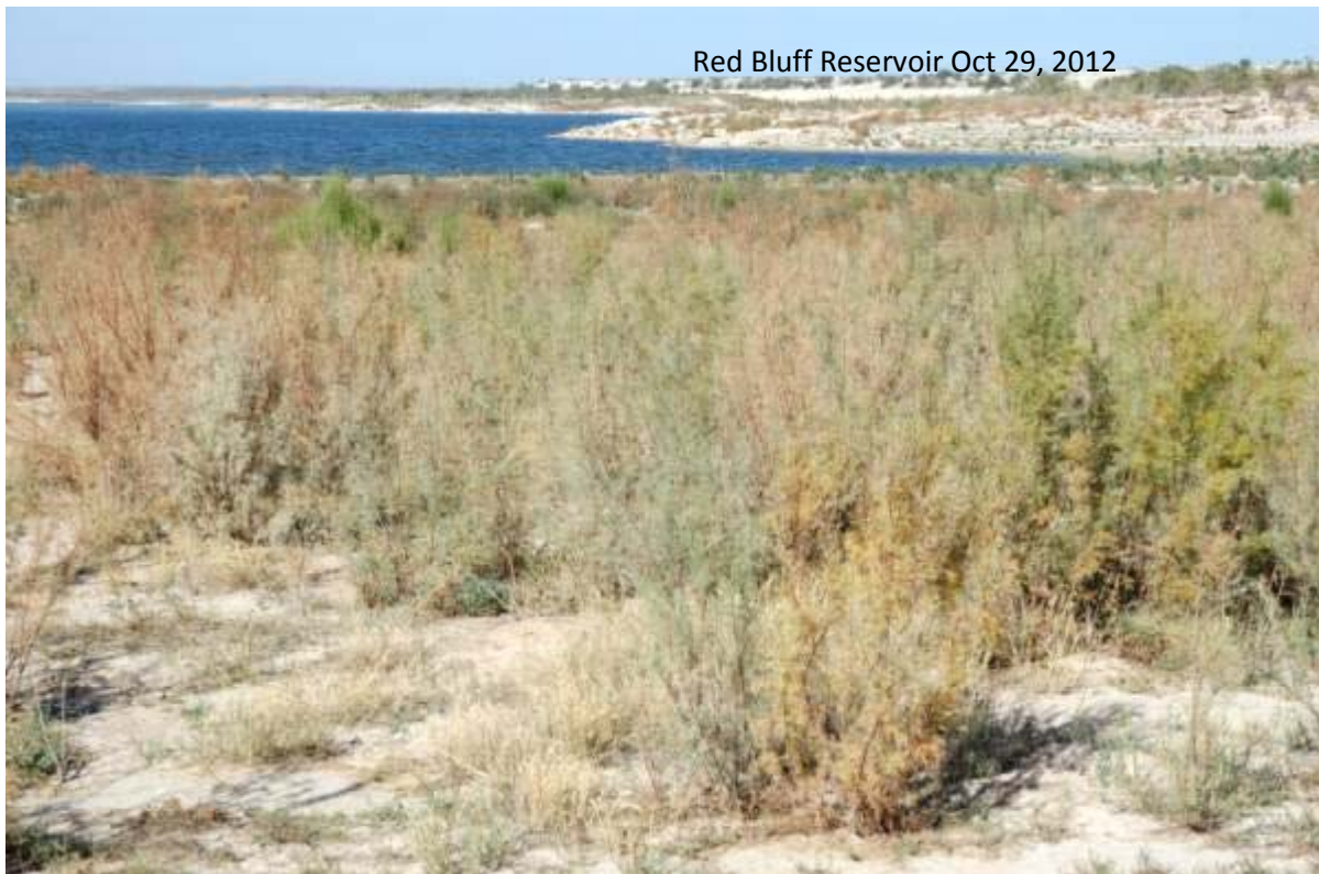
Red Bluff Reservoir Oct 29, 2012