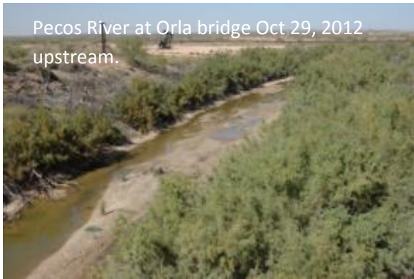
Pecos River at Orla bridge Oct 29, 2012 upstream.