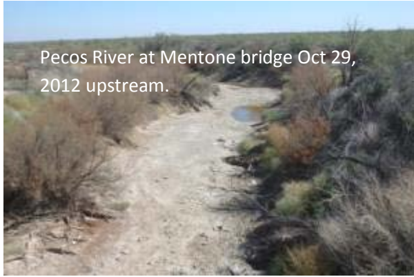
Pecos River at Mentone bridge Oct 29, 2012 upstream.