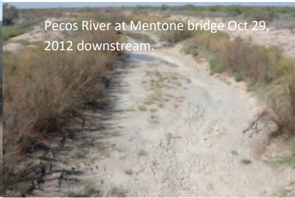
Pecos River at Mentone bridge Oct 29, 2012 downstream.